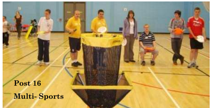
Post 16 Multi- Sports

We ended up with a total of 26 pupils from New Fosseway, Claremont, Kingsweston and Baytree (guests). Unfortunately Briarwood did not attend. Pupils mixed with peers from other schools to form teams, and the multi sports activities were scored with an overall result being announced. Excellent behaviour and attitude from all pupils on the day.