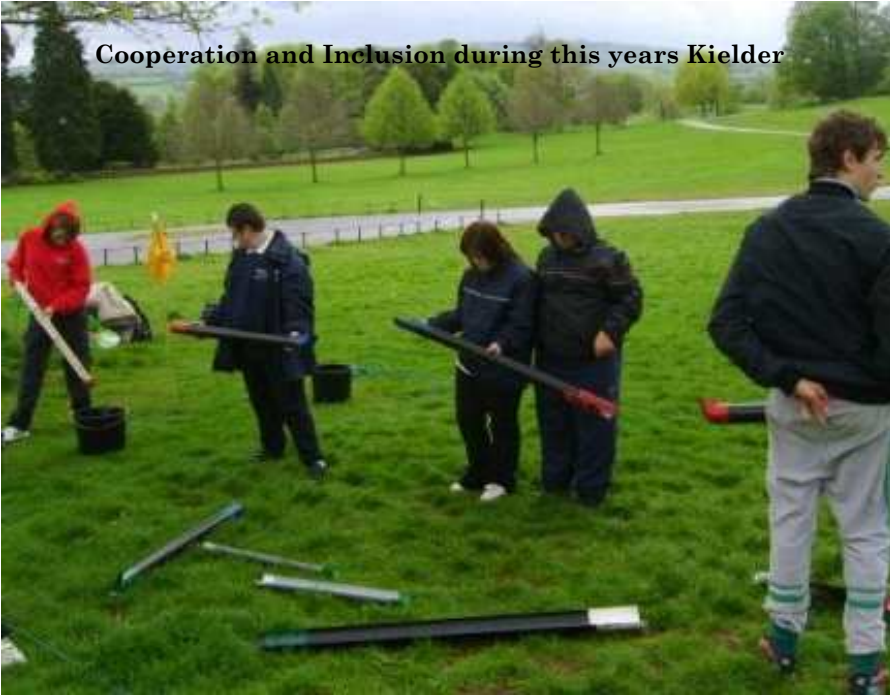
Cooperation and Inclusion during this years Kielder

The organisers of this national event (Fieldfare Trust) have seen a down turn in their funding sources over the last year, and so the event has been downsized with just one qualifying date in Bristol rather than two days in the past. The weather on the day was mixed but it did not dampen the spirits of the pupils attending.