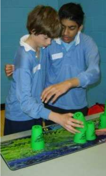
Left and right side co-operation challenge