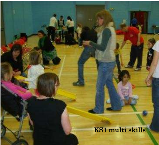
KS1 multi skills