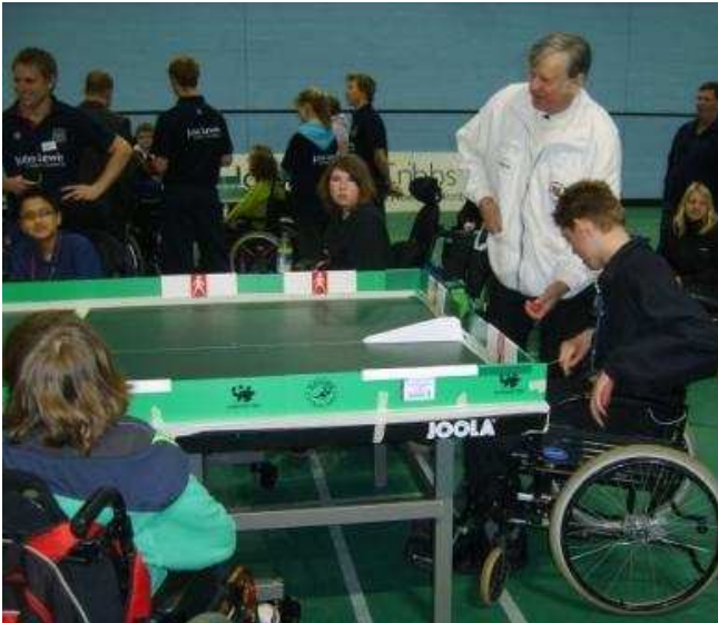
Table Cricket Regional Qualifying Event