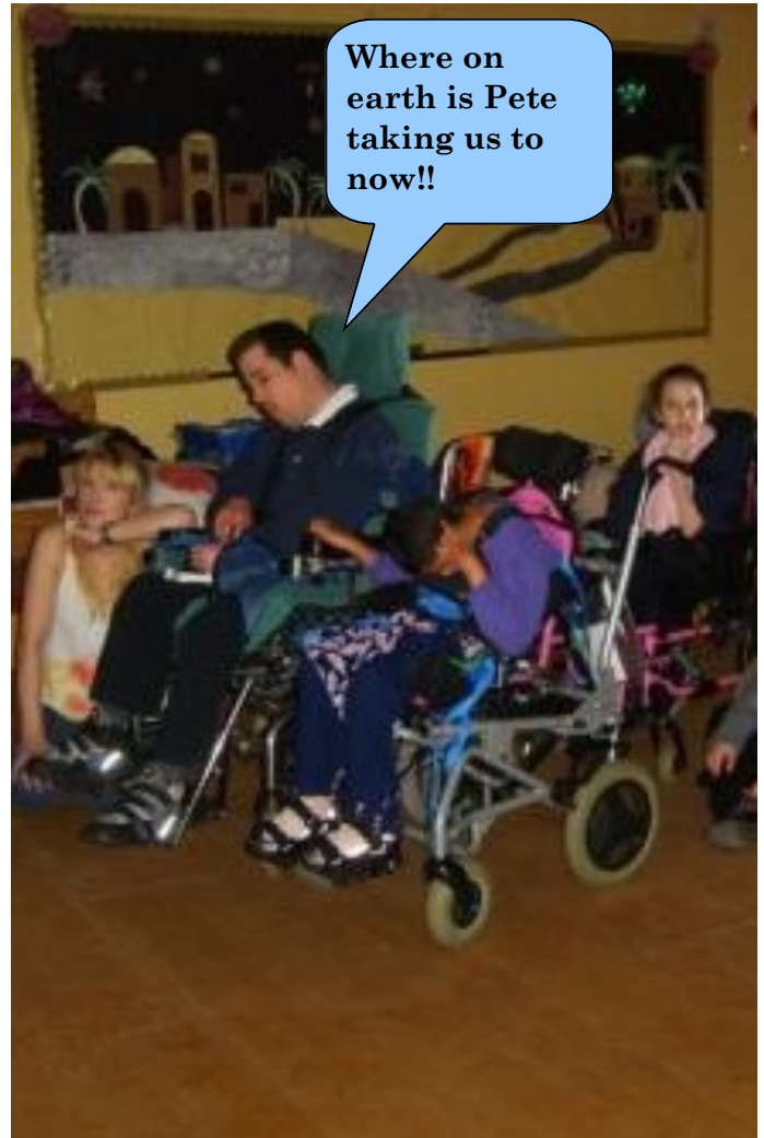
Rocket launch 10 seconds!!

Thanks to Briarwood school for facility use.