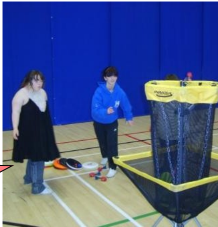
Young Leaders from Ashton aid delivery of Golf, Bowls, Disc Sports, Boccia and Kurling.