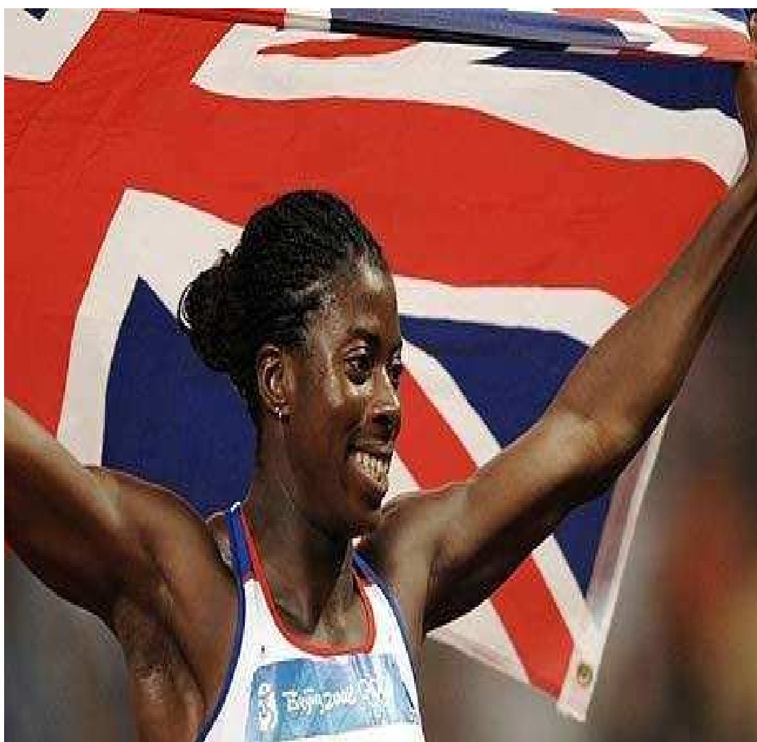
Christine Ohuruogu OLYMPIC GOLD MEDALIST IN BEIJING 2008