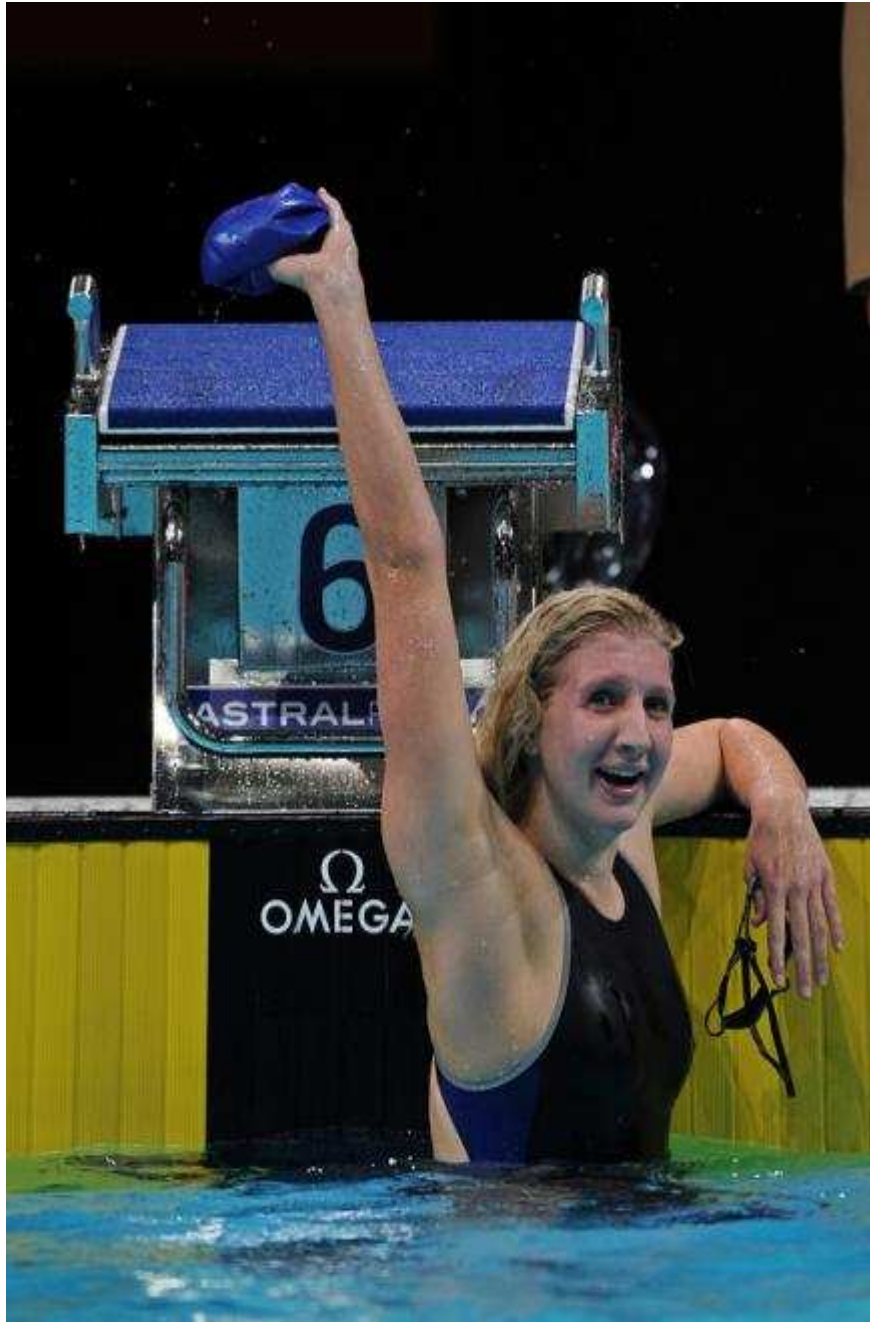
Rebecca Adlington OLYMPIC GOLD MEDALIST IN BEIJING 2008