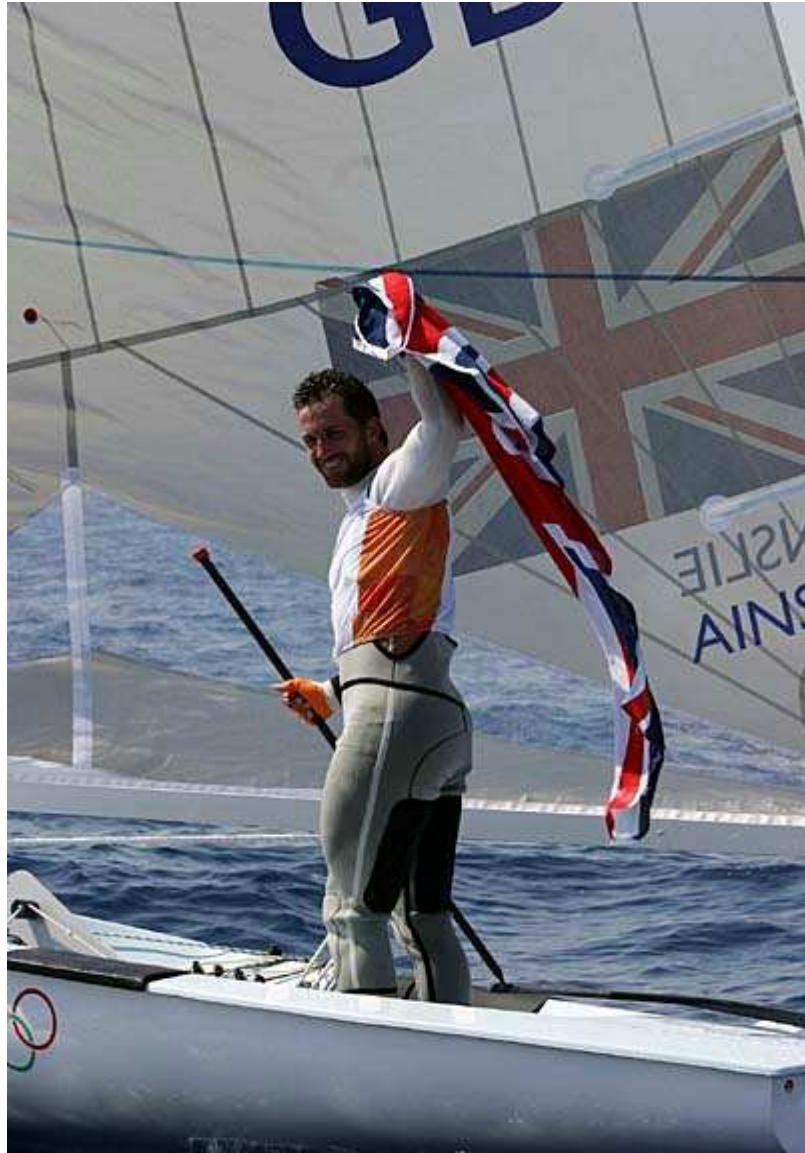
Ben Ainslie OLYMPIC GOLD MEDALIST IN BEIJING 2008