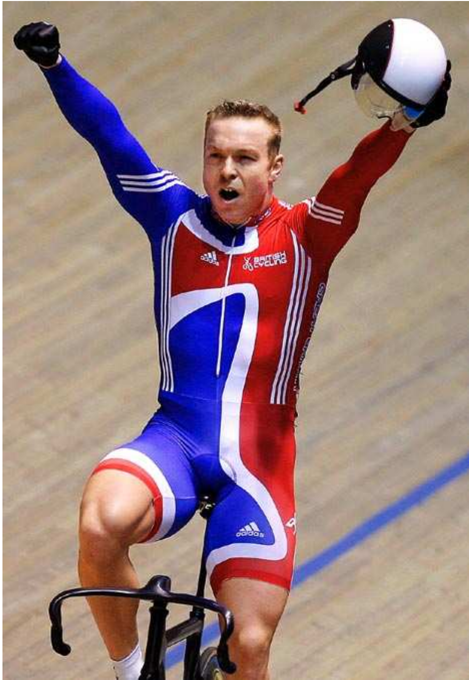
CHRIS HOY OLYMPIC GOLD MEDALIST IN BEIJING 2008