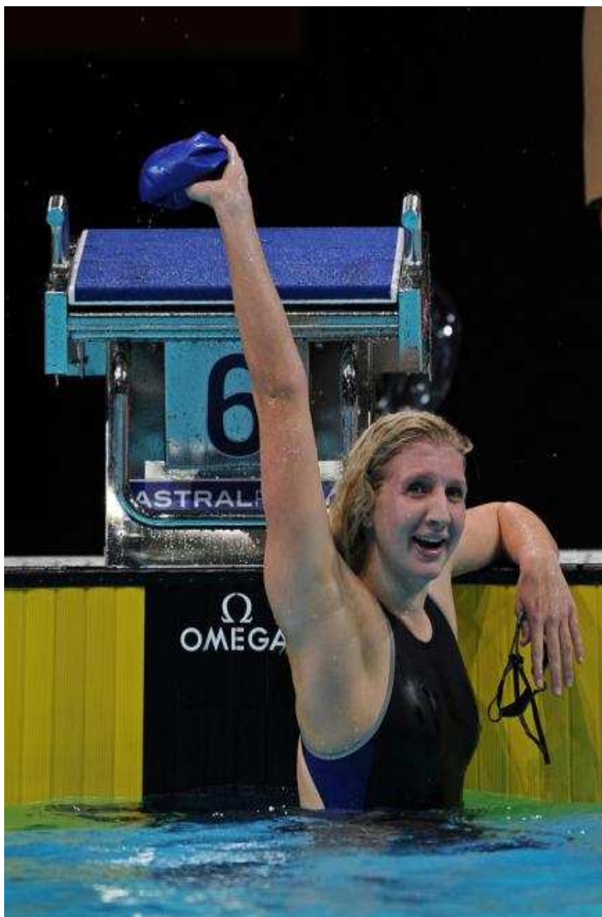
Rebecca Adlington OLYMPIC GOLD MEDALIST IN BEIJING 2008