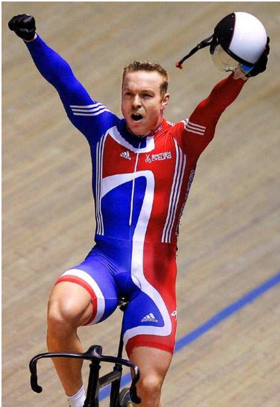
CHRIS HOY OLYMPIC GOLD MEDALIST IN BEIJING 2008